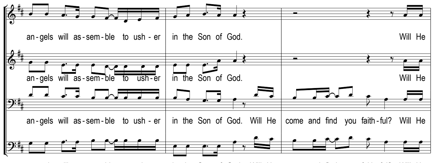
an-gels will as-sem-ble to ush - er in the Son of God. Will He come and find you faith-ful? Will He